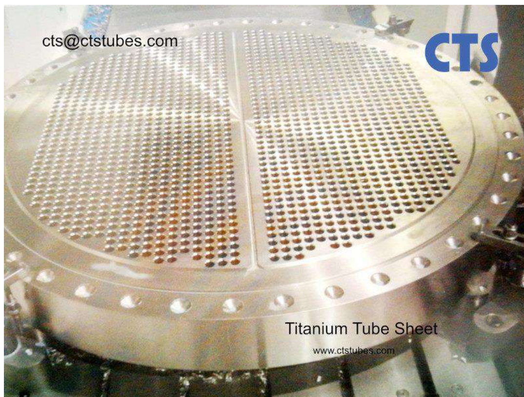
Titanium Tube Sheet