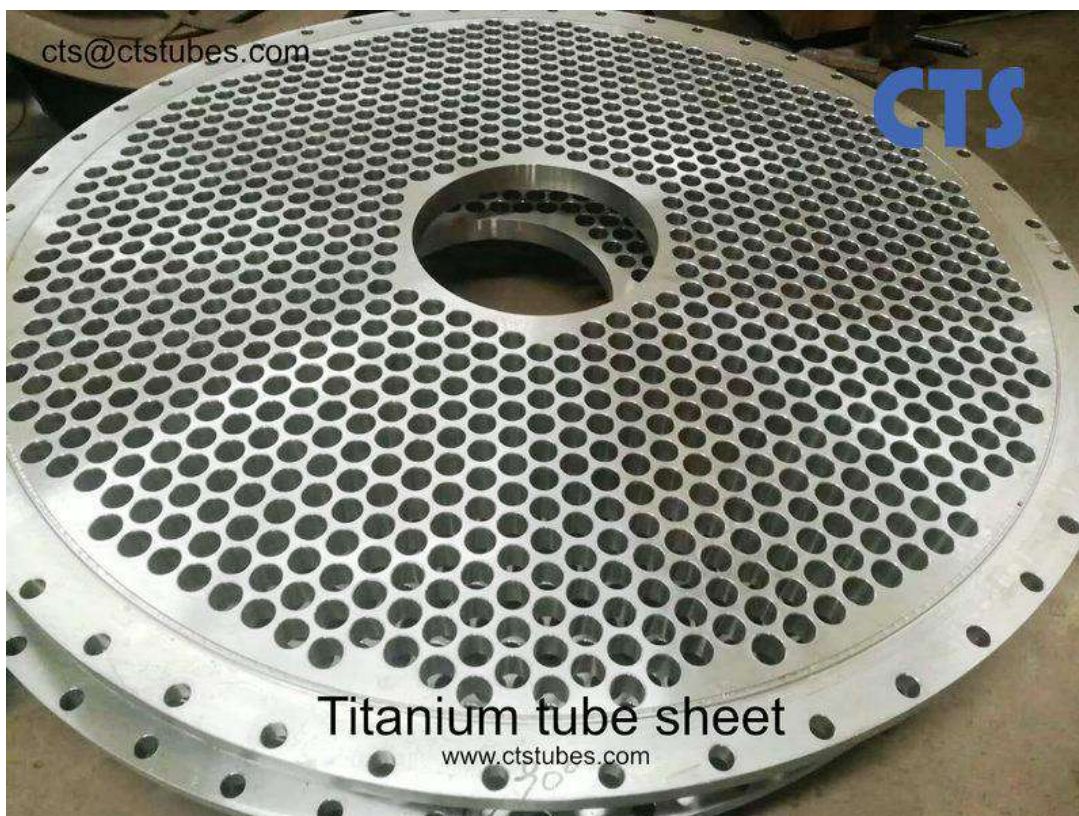
Titanium Tube Sheet for Exchanger